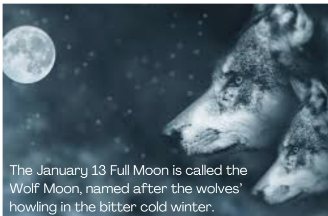
The January 13 Full Moon is called the Wolf Moon, named after the wolves' howling in the bitter cold winter.

Share your kindness story with us! Please submit your stories to clerk@tijerasnm.gov and we will post it in our February Newsletter!