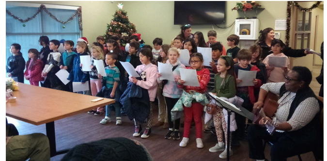
A. Montoya 3rd and 4th graders singing carols, Dec. 12