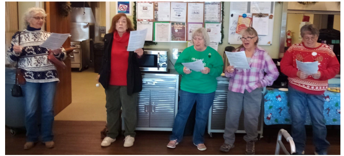
Cowboy Church Carolers, Dec. 11

-New! BernCo Extension's Get Fit Class - Tuesdays and Thursdays, 9am-10am, and Keys to Embracing Aging, 10am-11am. 6 week programs starting Feb. 25 - April 3. Sign up.